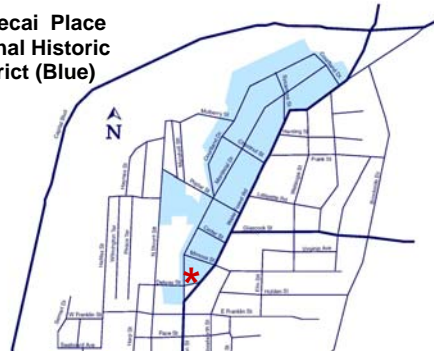
Mordecai Place National Historic District (Blue)

Learn more at: mordecai.org northperson.com seaboardstationshops.org historicoakwood.org raleighnc.gov/planning rhdc.org